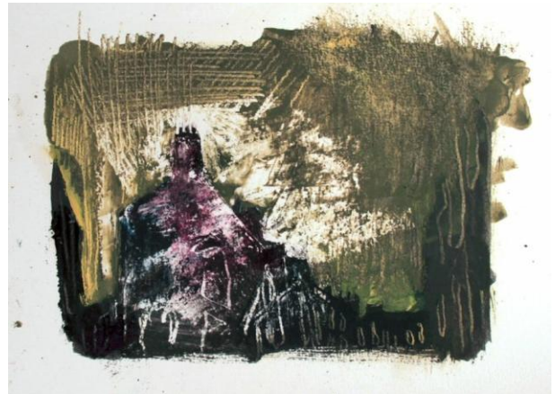
The King's Arms (2013)